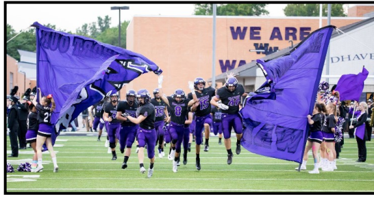
Friday Night Lights — Warriors take the field.