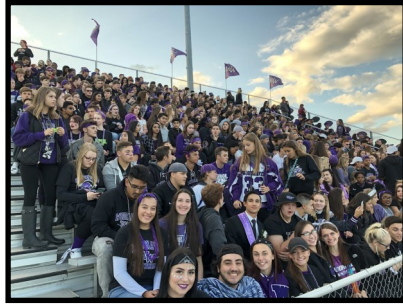
WHS Student Section — The Tribe!!